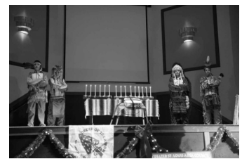
Above: Members of the New Horizons Chapter performed the closing ceremony.