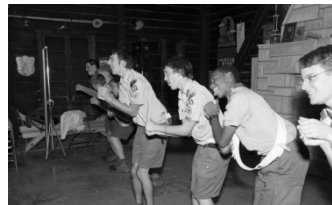
The Shawnee Lodge officers perform a skit during the campfire.