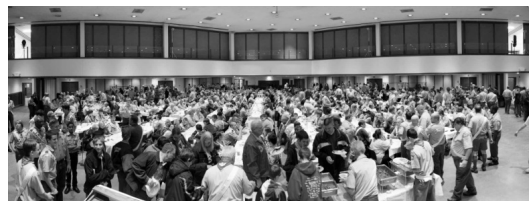
Below: Scouts and Scouters from across the Council sit down to enjoy the meal.