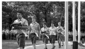
The colors are retired on Saturday night.