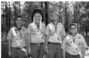
The newly elected Boone Trails officers pose for a shot.

Our Lodge welcomed new arrowmen to the Brotherhood of Cheerful Service at the Fall Reunion. It was a successful event, which officially ushered in the new slate of Lodge and Chapter officers.