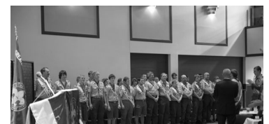
The Vigil Candidates sat down together after being recognized.