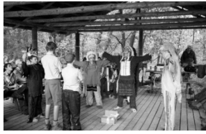
Ceremonial Teams practice for the night's performance.