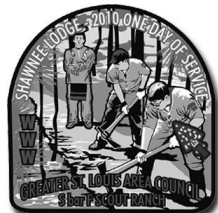
Patch for the One Day of Service 2010