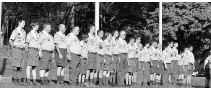
The 2010 Vigil Candidates are officially installed as new Vigil members.

The 2010 Spring Conclave was held at Beaumont Scout Reservation on April 16-18. The Lodge hosted a Good Turn Project at this event - a canned food drive. Each Arrowman brought at least one can of food to the Conclave. All of the cans were distributed to a local food pantry on Saturday afternoon of the conclave.