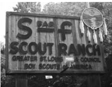
The sign for the S bar F Scout Ranch

The Shawnee Lodge's One Day of Service was held from April 30 – May 2, 2010 at the S bar F Scout Ranch. Projects focused on repairing the property after a 2009 storm.