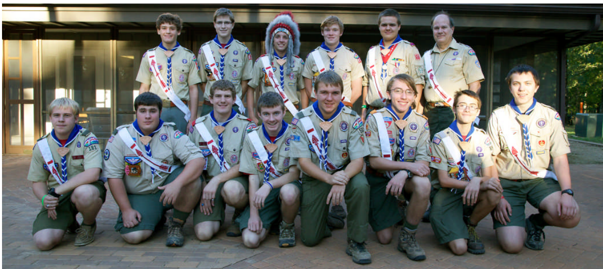
2012-13 Shawnee Lodge Officers and Chapter Chiefs

Congratulations to all that have offered to serve their fellow brothers